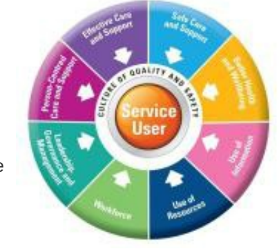
Pictured are the themes of the National Standards for Safer Better Healthcare