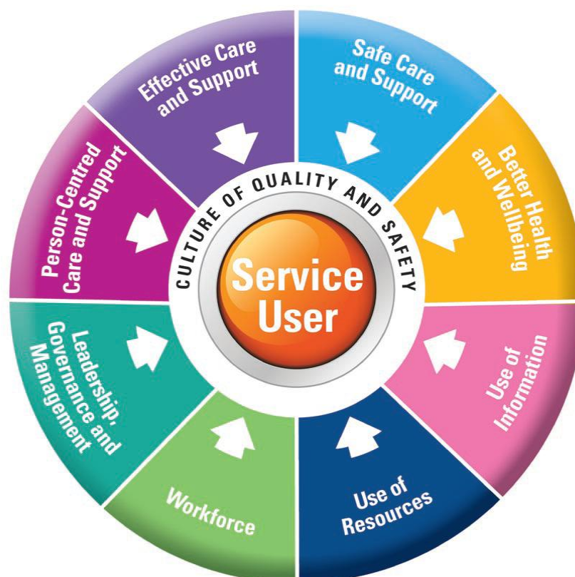
Figure 1. Themes for quality and safety

The four dimensions of quality and safety are: