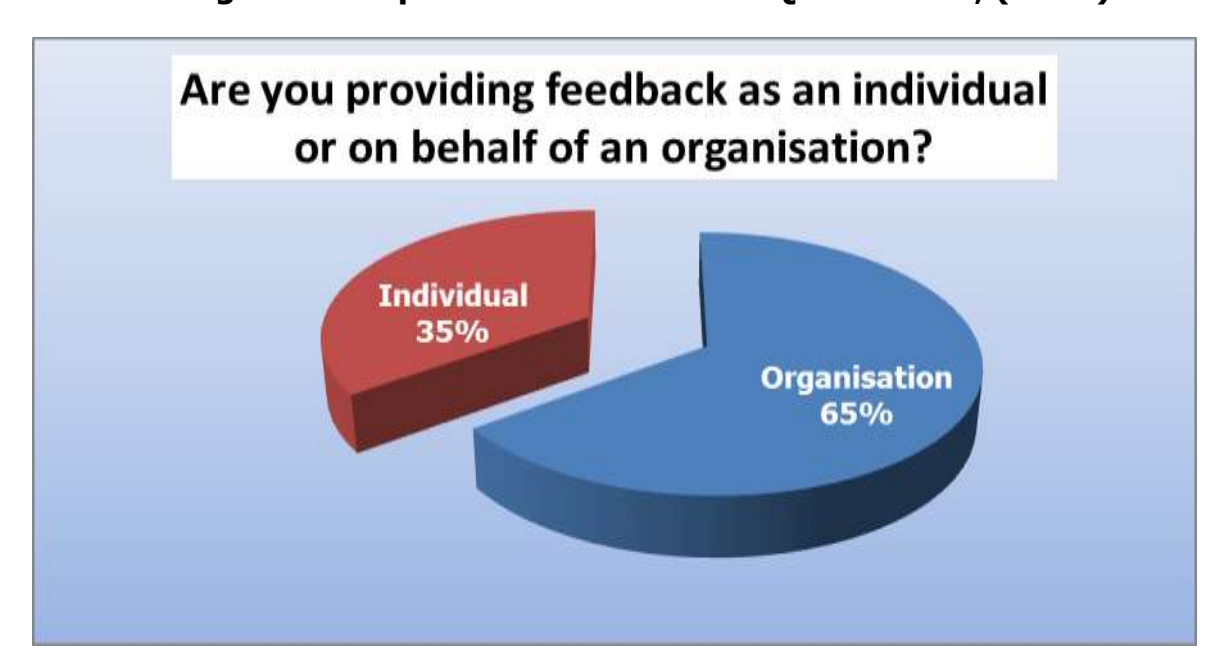
Figure 1: Responses to consultation Question 1.1, (n=40)

Of these 32 respondents, almost all respondents 91% (n=29) stated that they were providing feedback as an individual working with children in residential care (some of which were providing group feedback on behalf of children in their residential centre), while 6% (n=2) had past experience living in residential care and 3% (n=1) stated they were a child currently living in residential care.