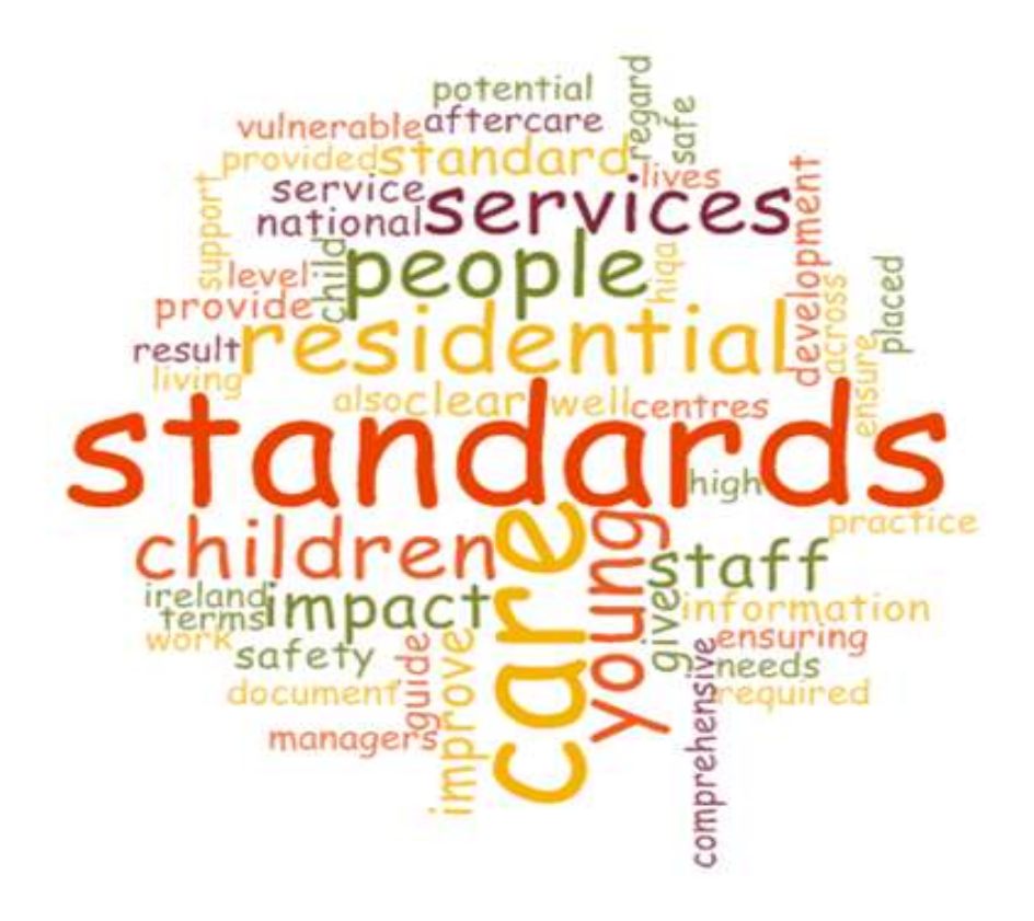
Figure 5: Most frequently used words by respondents on the impact of the draft standards.

The majority of respondents who answered this question agreed that the draft standards will have a positive impact on the care and support that children receive in residential care, when they are in place.