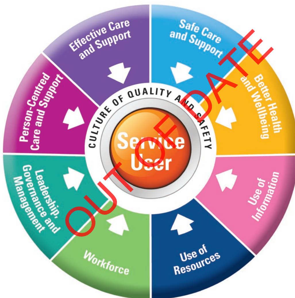
Figure 1: Themes for Quality and Safety

The National Standards are set out in full in the pages that follow.